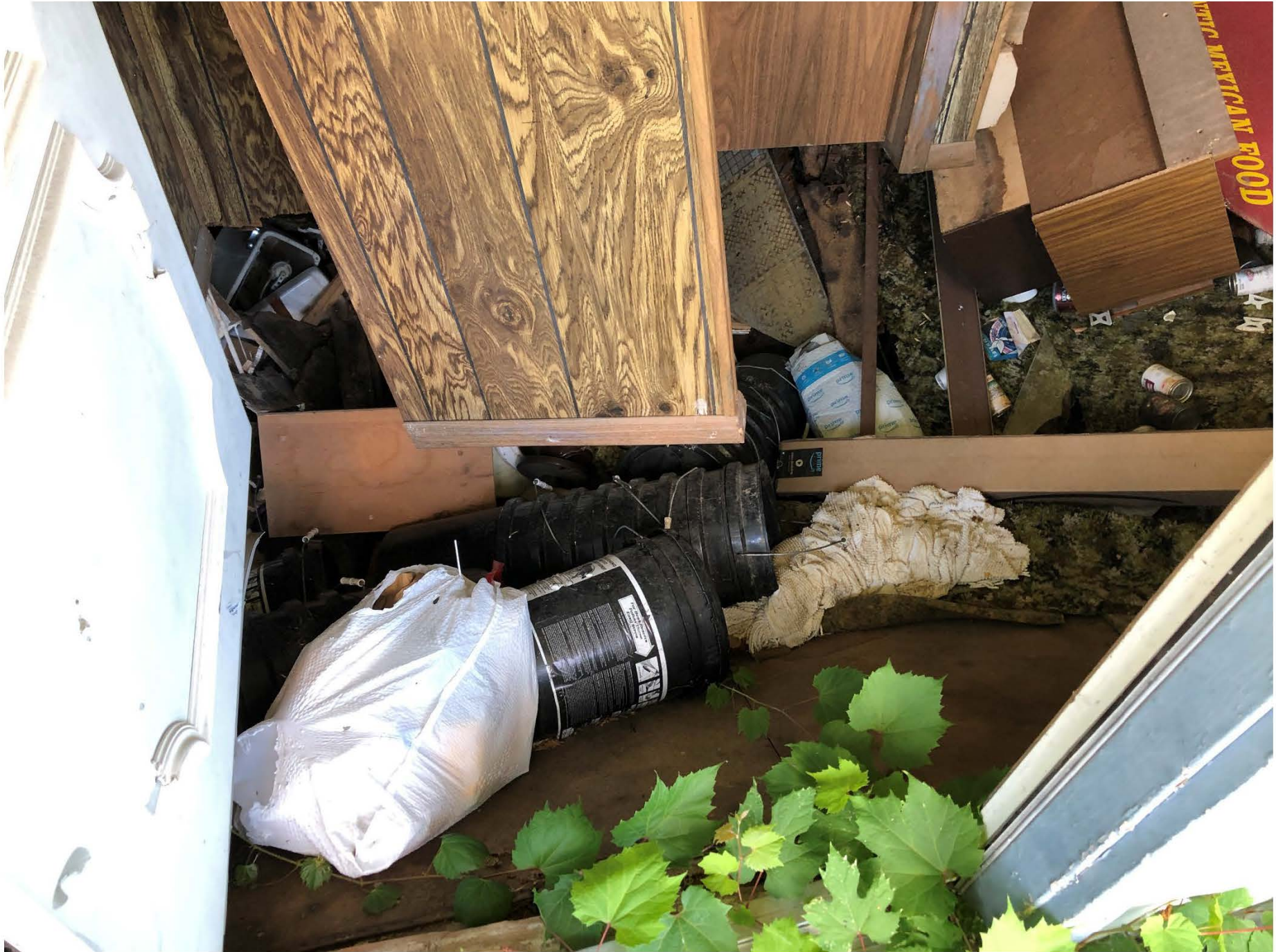
Figure 2: Additional Room Complete Floor Collapse