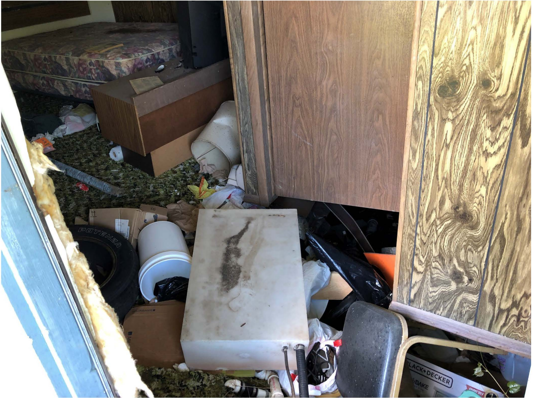
Figure 1: Floor Collapse - Bottom Right