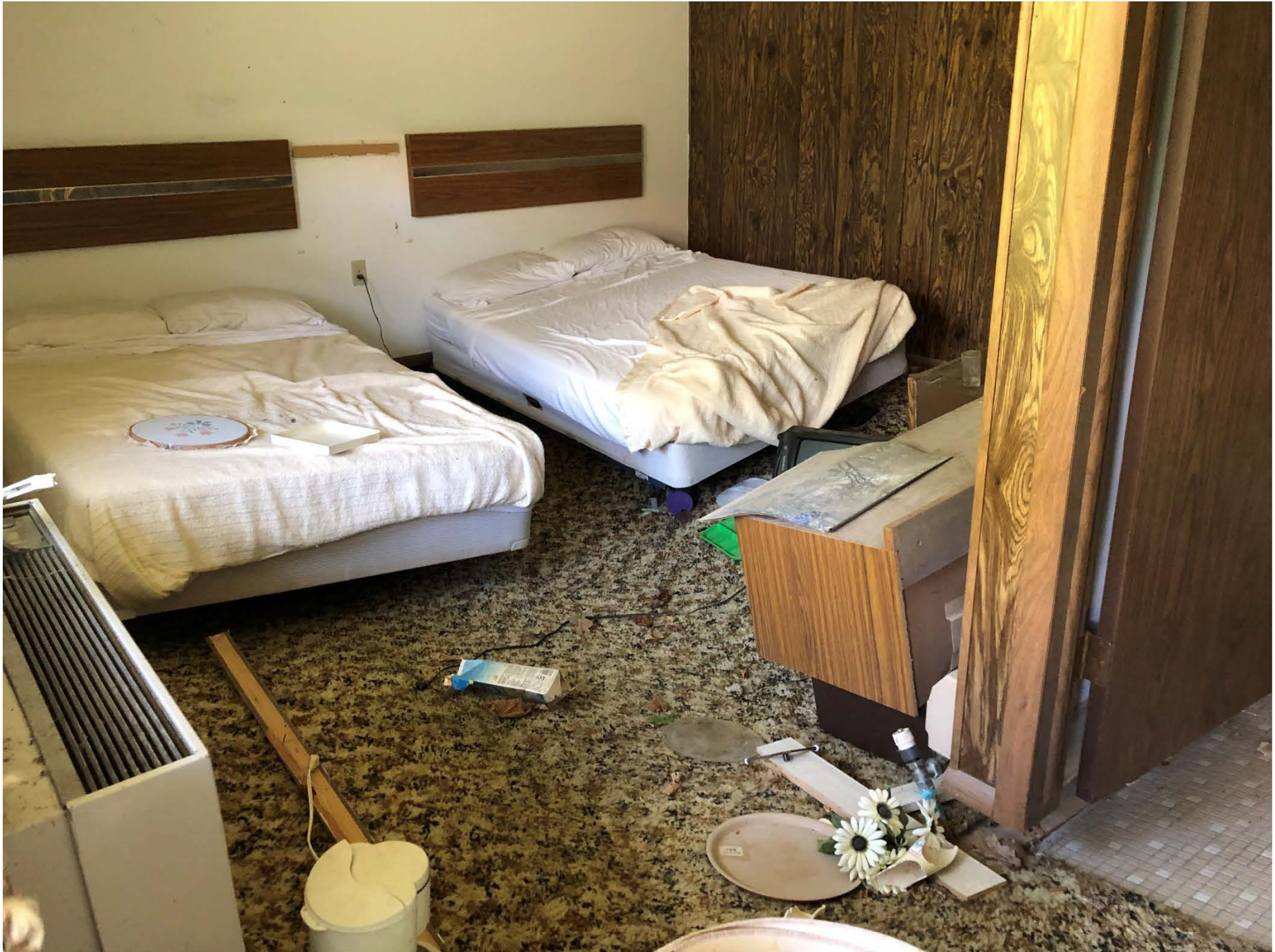
Figure 4: Floor Sagging - Failure Imminent