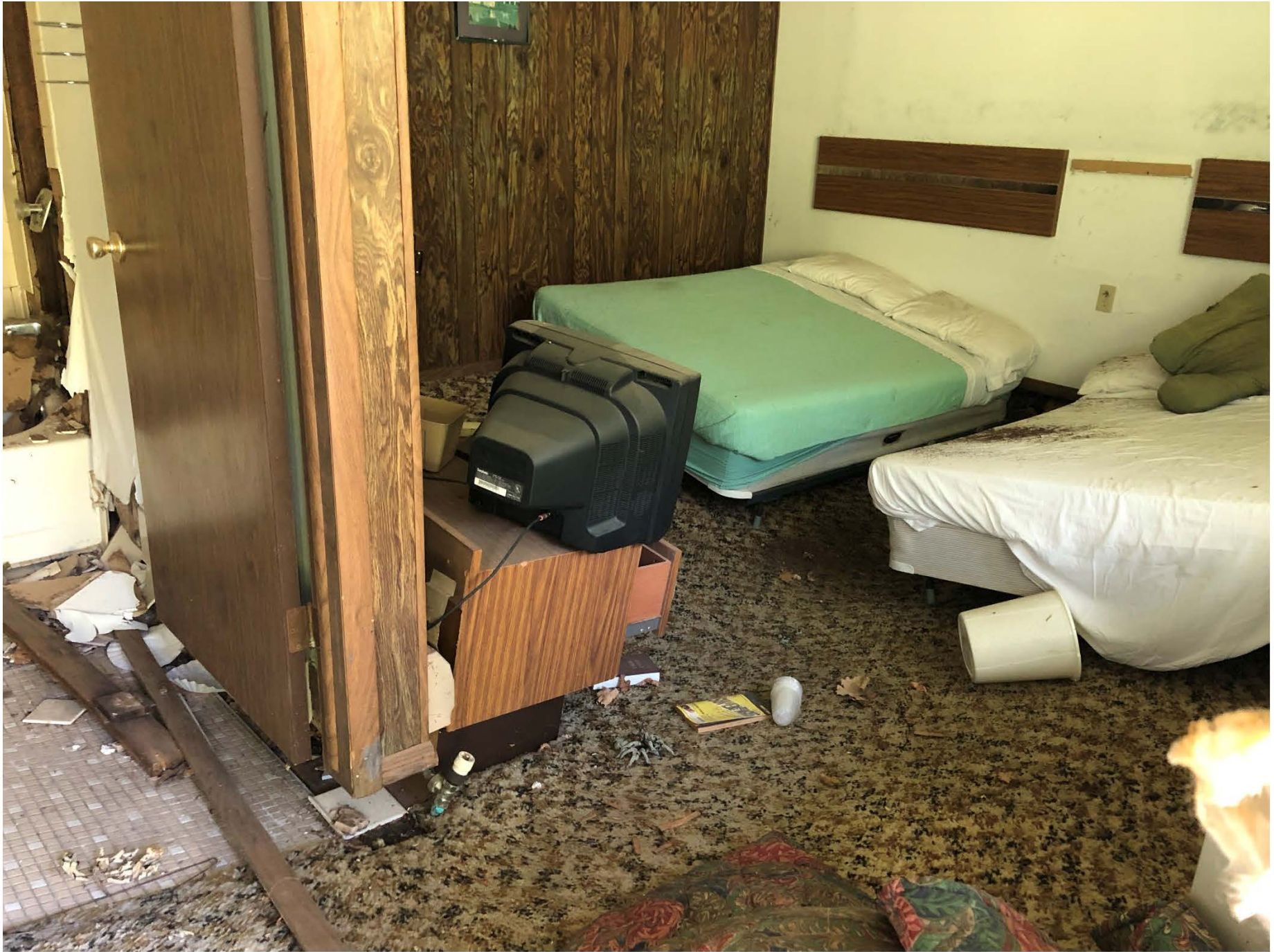
Figure 3: Floor Sagging - Failure Imminent