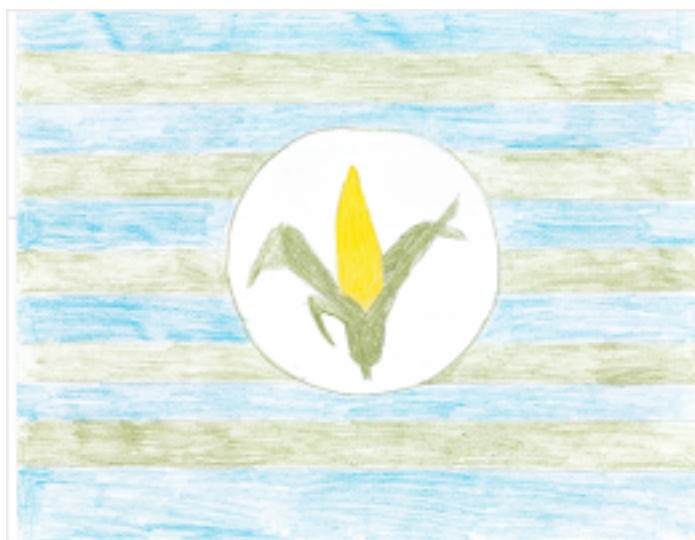
Child's Flag 2