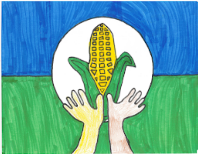
Child's Flag 1