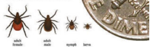
Blacklegged Tick ( Ixodes scapularis )

Warm weather will soon be here which means the ticks will become more active. Richland County has an increased number of confirmed cases of Lyme Disease each year. It is important to check for the presence of the black legged tick (or deer tick, ixodes scapularis) after being in grassy or wooded areas. The Ixodes tick is much smaller than the common wood tick.